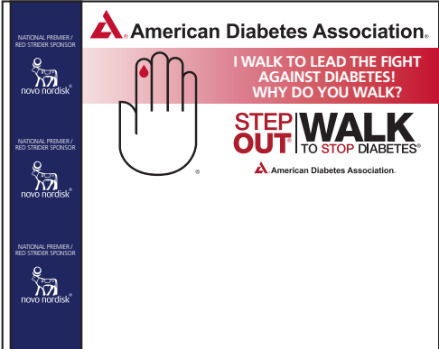
Repeater Banner Option 2 - 8'x10'