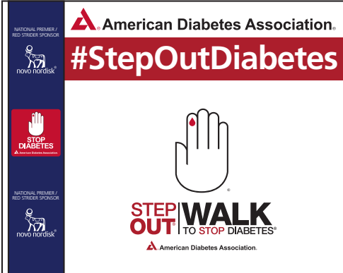
Repeater Banner Hashtag Option 3 - 8'x10'