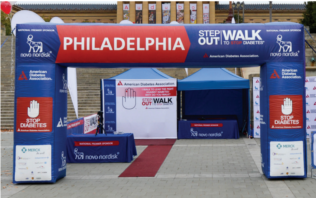
Step Out: Philadelphia, PA Nov. 7, 2015