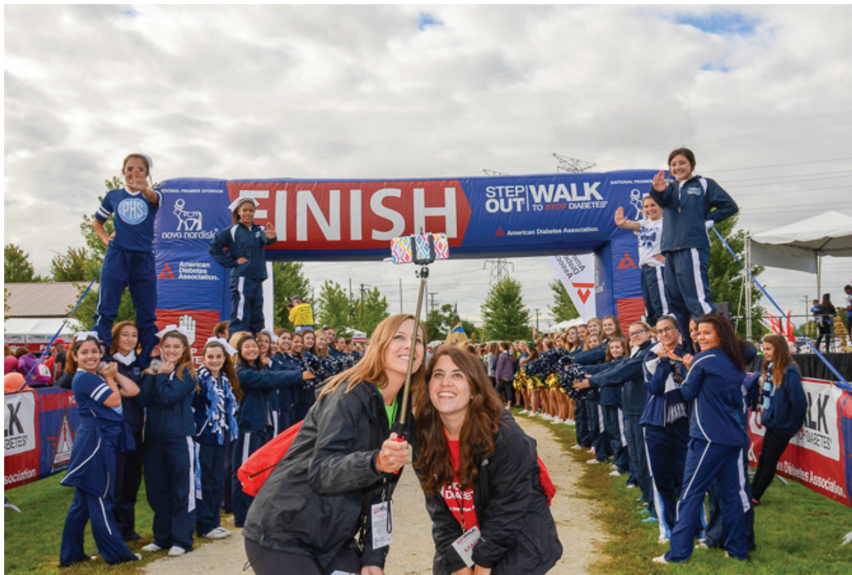
Step Out: Buffalo Grove, IL Sept. 19, 2015