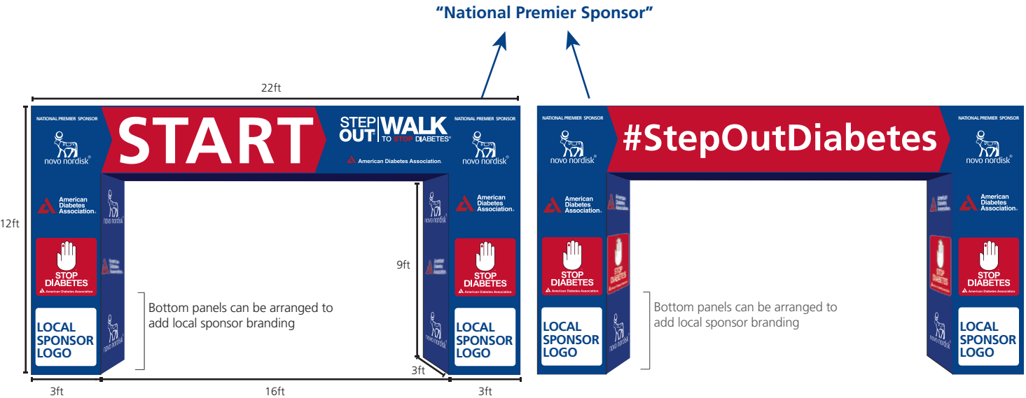
Inflatable Arch Arch Interior: 9' Tall, 16' Wide, 3' Deep Arch Exterior: 12' Tall, 22' Wide, 3' Deep