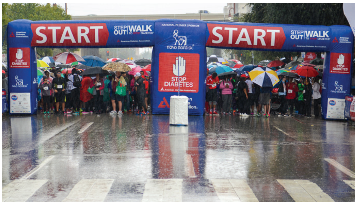
Step Out: Houston, TX Nov. 21, 2015