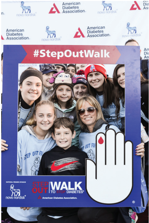
Step Out: Boston, MA Oct. 17, 2015