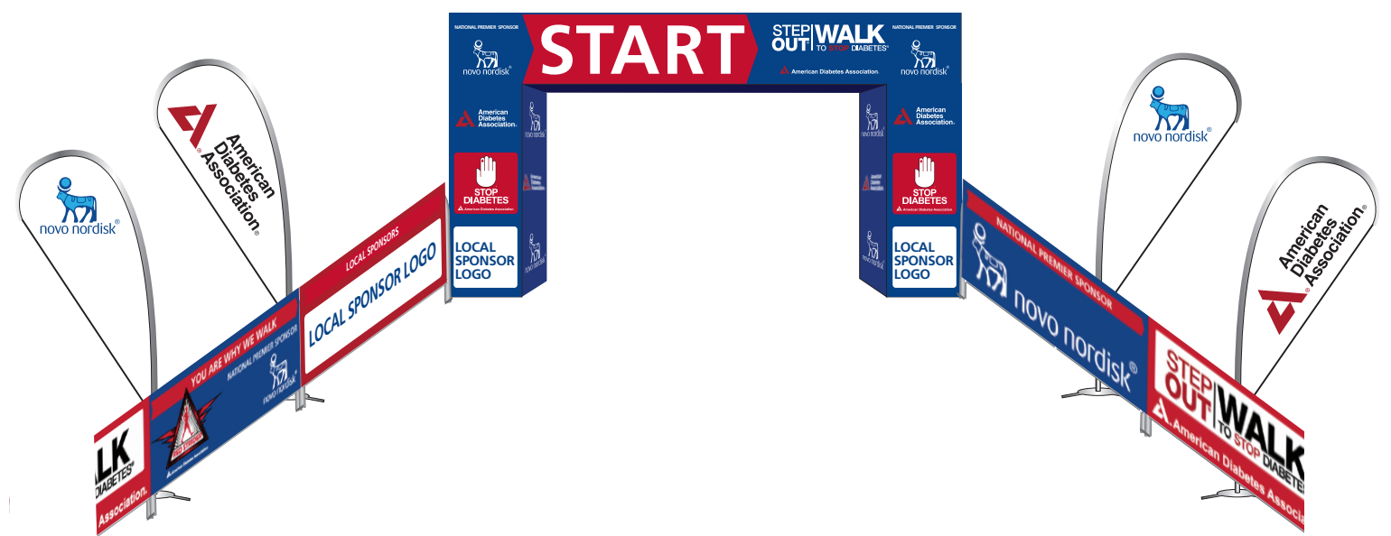
Inflatable Arch Arch Interior: 9' Tall, 16' Wide, 3' Deep Arch Exterior: 12' Tall, 22' Wide, 3' Deep