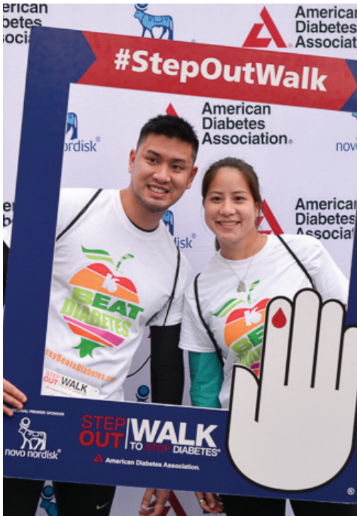
Step Out: Houston, TX Nov. 21, 2015