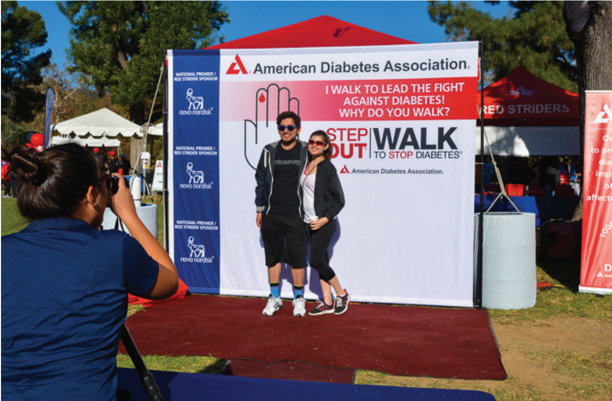
Step Out: Los Angeles, CA Nov. 15, 2015