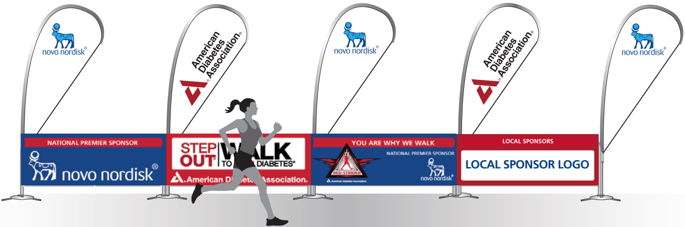
Mesh Fencing Local Sponsor Panel: 3' Tall, 8' Wide Novo Nordisk ADA Co-Branded Panel: 3' Tall, 24' Wide