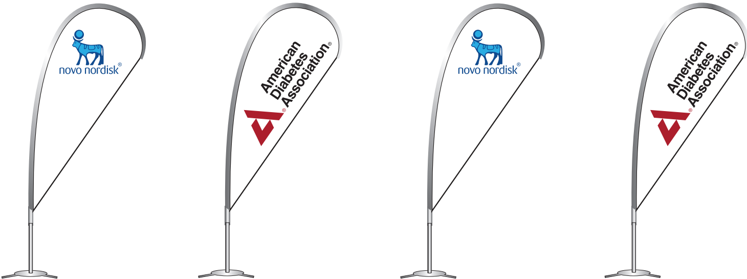
Tear Drop Banners 11'8" Tall