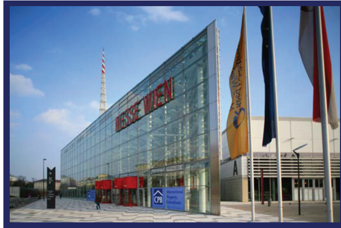
REED MESSE WIEN MAIN ENTRANCE