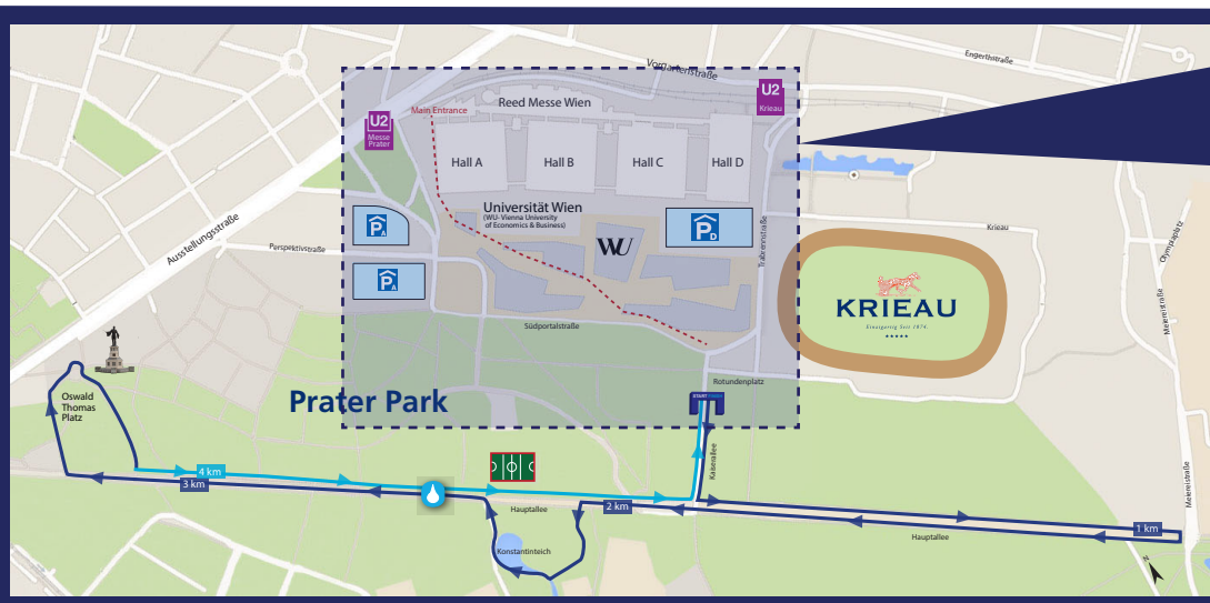
EASD COURSE MAP & PRATER PARK