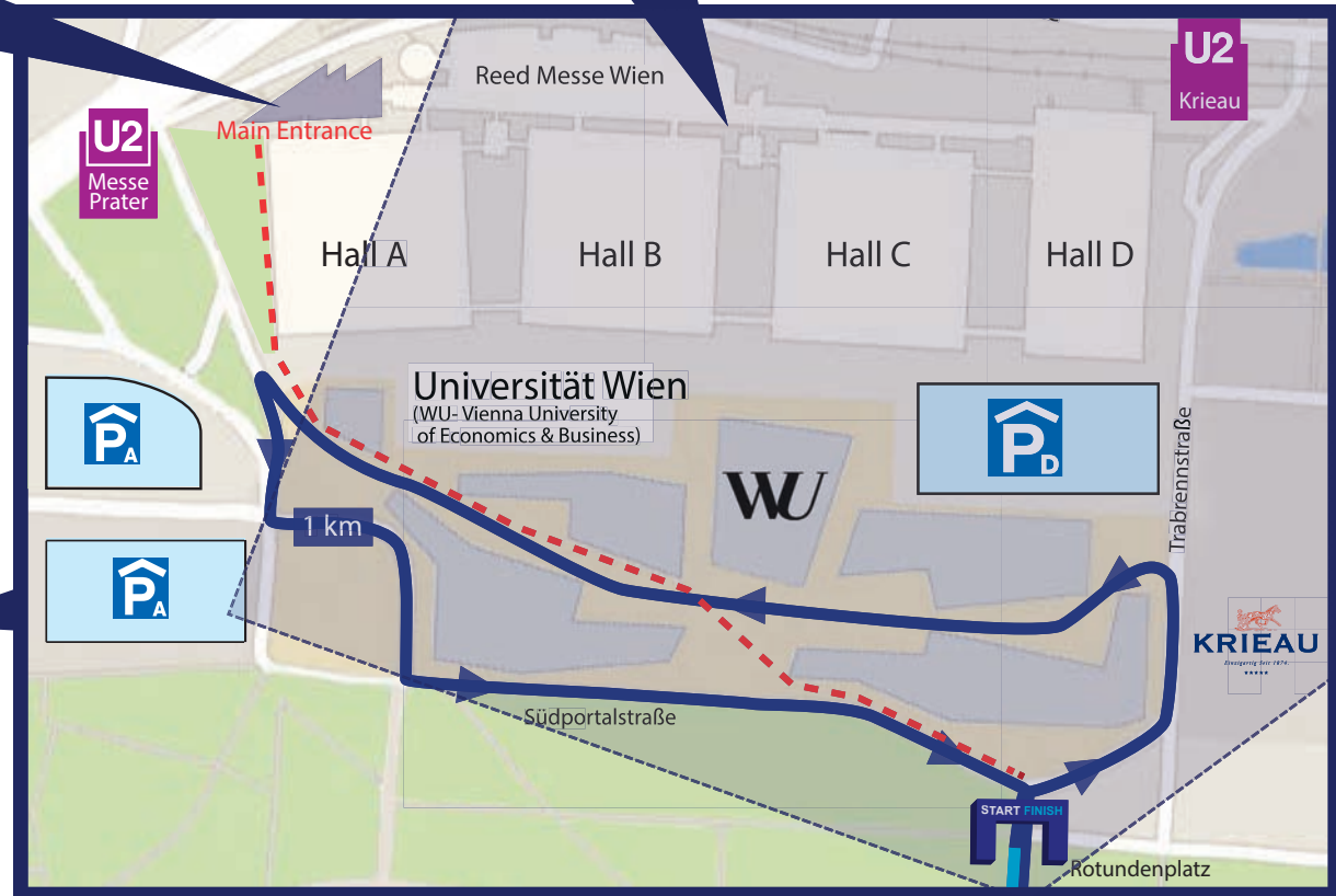
CLOSE-UP OF WALKING ROUTE TO START LINE

--- WALKING ROUTE FROM MAIN ENTRANCE TO START PLEASE ALLOW 6-7 MINUTES FOR WALKING