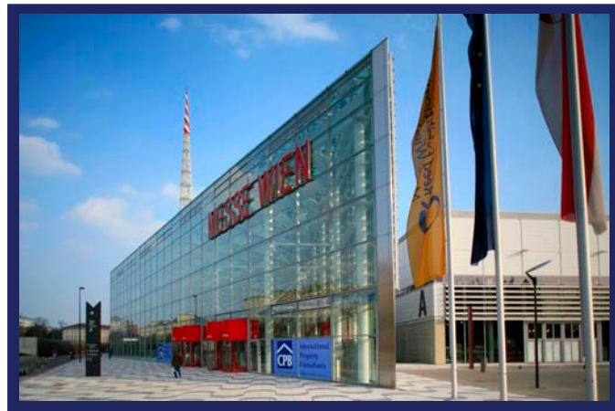
REED MESSE WIEN MAIN ENTRANCE